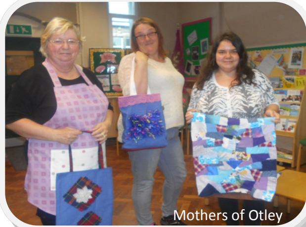
Mothers of Otley

The Community Committee fund a range of community projects. Some of the great projects include -